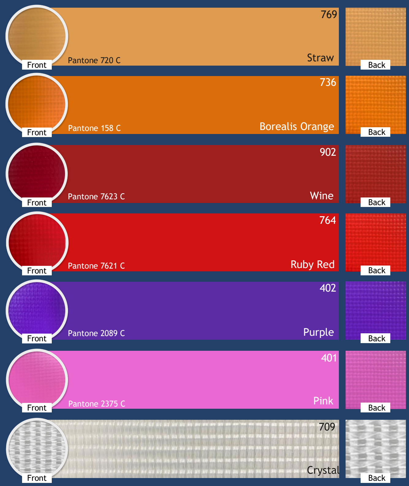
*Colors for visual reference only, do not use as a color standard.