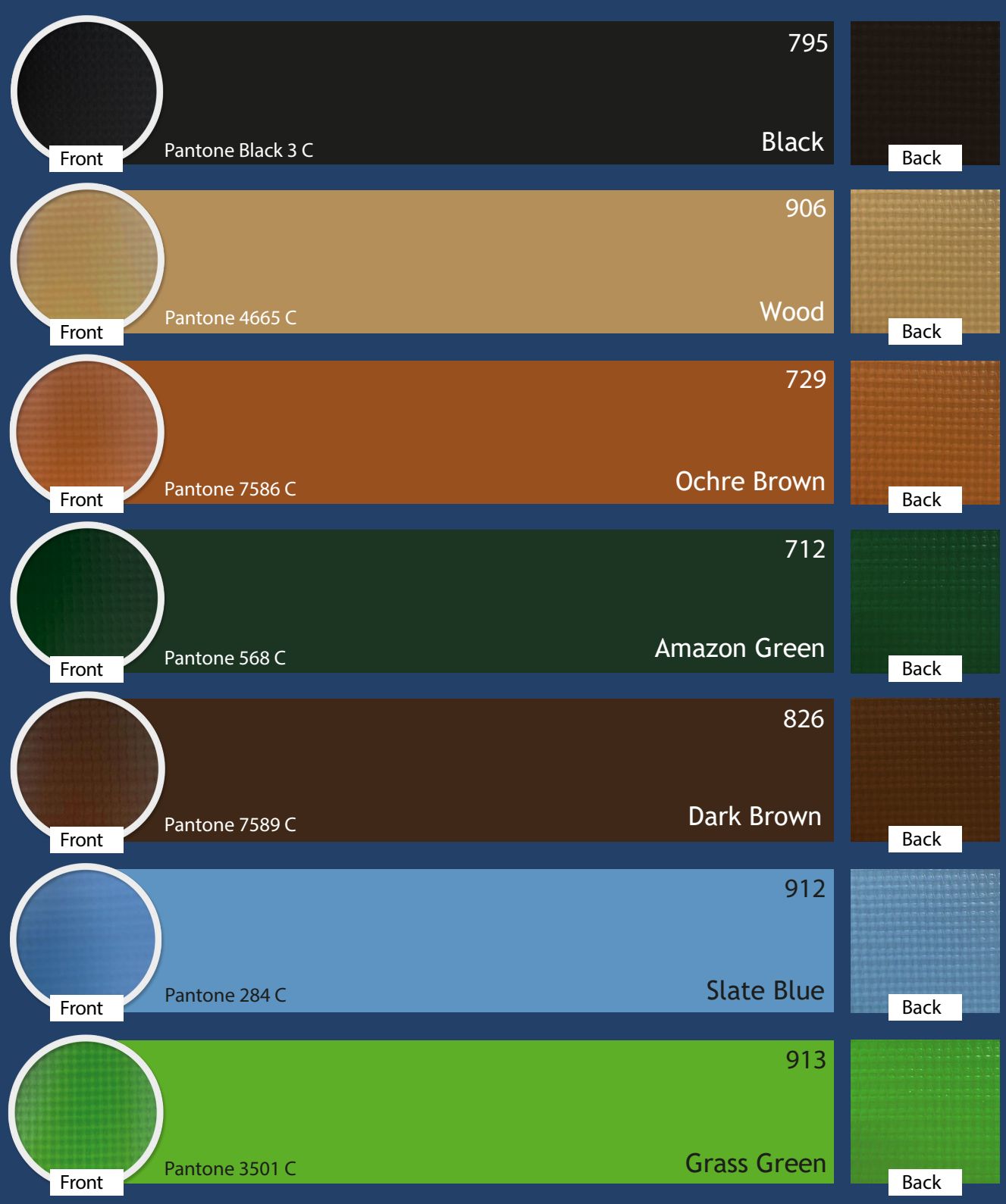
*Colors for visual reference only, do not use as a color standard.